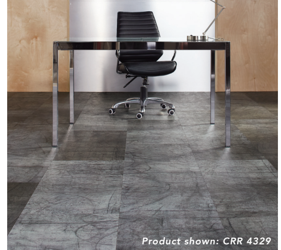
Product shown: CRR 4329